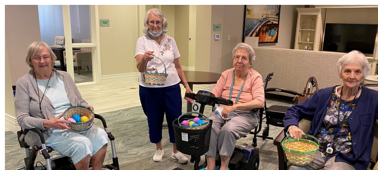
The ladies enjoying the Easter Egg Hunt!