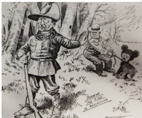
Cartoon of Teddy Roosevelt with captive bear