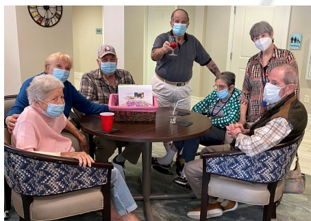
Residents having fun at Happy Hour!