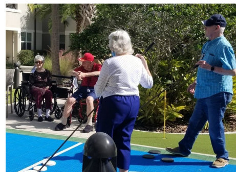
Residents playing shuffleboard in our beautiful Courtyard.