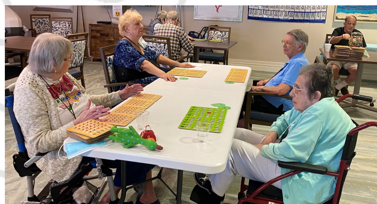
Having fun at Bingo!