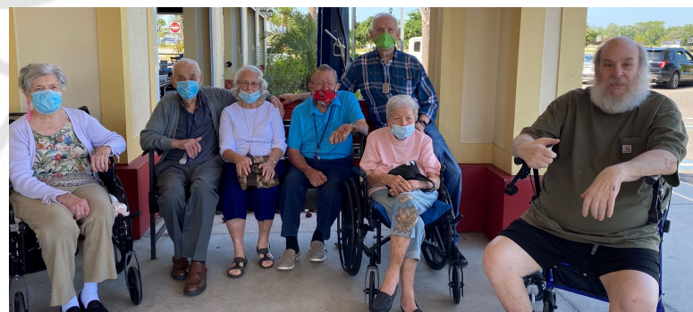
Our residents enjoying lunch at Ford's Garage.