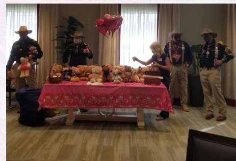
The Rough Riders setting up to give the residents their Teddy Bears! This was so much fun! The residents loved it!